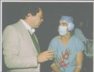
Would you really trust Bobby Nystrom in this get-up?