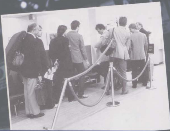
Somebody is taking a little extra baggage with them!