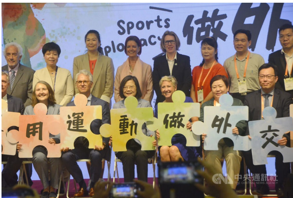
President Tsai Ing-wen (center) with winners and event organizers at the first-ever Women in Sports International Photo Awards

The association said it received more than 1,300 entries from photographers in 52 countries for this year's photo contest, which aims at honoring outstanding sports photography and bringing more attention to women athletes.